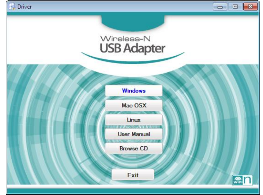
Step 3: Choose "Windows" in the Menu.

Step 4: Wait until the installation is finished.